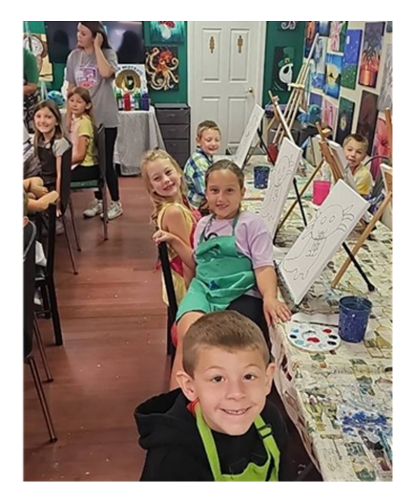
What's Happening at KidsFirst Childcare?

There will be coffee, tea and snacks at 9:00 and lunch will be served at noon. There is no charge. If you are grieving any kind of loss, mark your calendars for January 4.